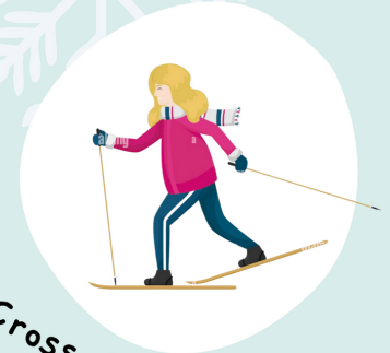
Cross Country Skiing

OPENING CEREMONY SATURDAY, FEBRUARY 12 AT 8:30 AM