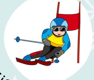
Giant Slalom Skiing